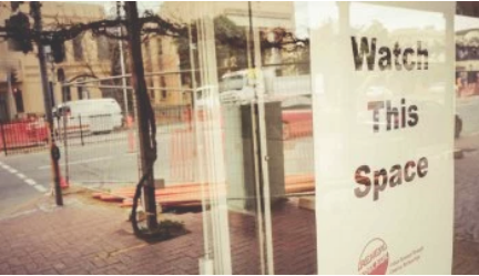
Creative Cool - Renew Adelaide In "Art"