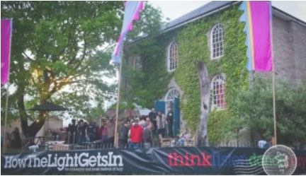
Thought Yurts and Think Tents - Philosophy and Music in Hay-on-Wye In "Books"

Tags: Adelaide Fringe , BankSA , beach , BikeSA , Edinburgh , festivals , free , Fringe , Story City , sunset