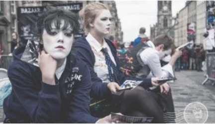
The Upside-Down Cow of Comedy - The Edinburgh Fringe In "Art"